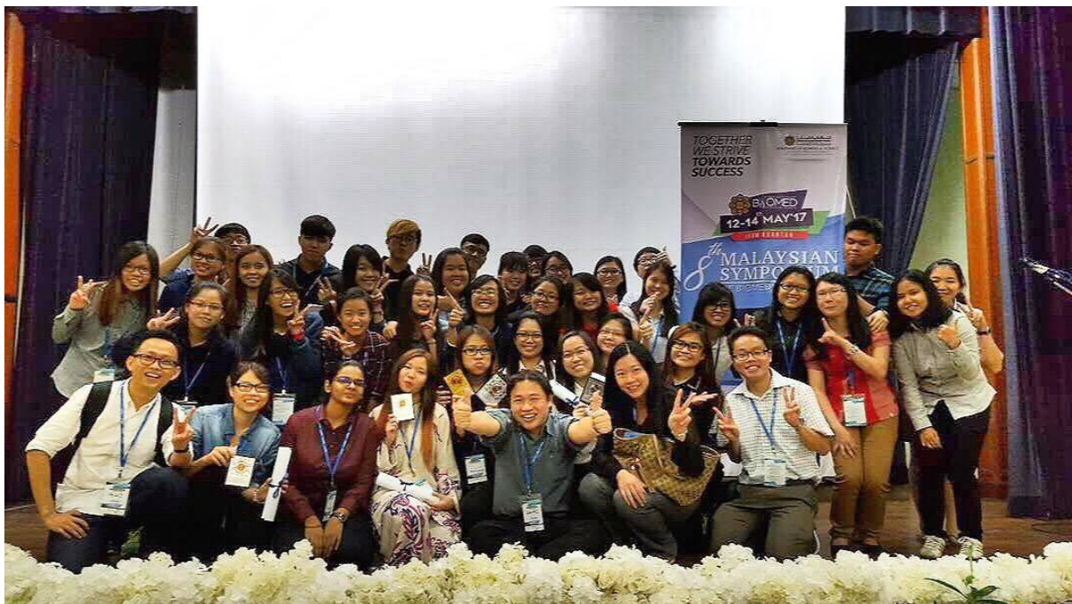
UTAR Contingent to the 8 th Malaysian Symposium of Biomedical Science 2017, IIUM

The winners were presented with a trophy, a certificate and a cash prize worth RM30.00. With this achievement, UTAR became the second biggest winner of the symposium after Universiti Kebangsaan Malaysia. Most importantly, this was a consecutive achievement for UTAR for having won several major awards in previous symposiums since 2014. Congratulation to all the winners!