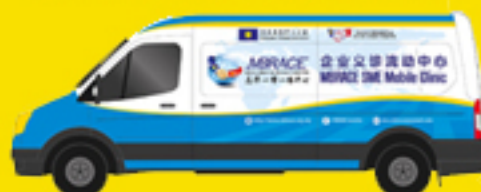
MBRACE SME Mobile Clinic

Free business consulting services & One Belt, One Road Information